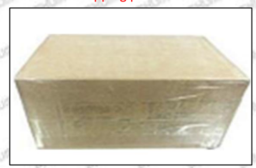
Pic No. 2 Domestic express packaging: Wrapped by Transparent tape

▲ Minors are prohibited from using transparent tape, yellow tape, black wrapping protective film, and white wrapping protective film to avoid personal injury.